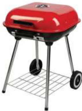
Charcoal Barbecues Product Line