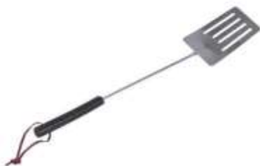
Barbecue Accessories Product Line