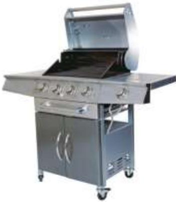
Gas Barbecues Product Line